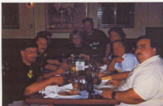
THE PITTSBURGH, PA MINI-HEEPVENTION WAS WELL ATTENDED BY CAROLINA HEEPSTERS AND FRIENDS