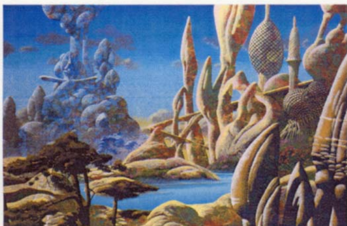
CITY SPRING - THE ORIGINAL PAINTING • ©2001 ROGER DEAN