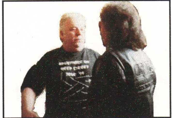
Lee Kerslake (background) and Ken Hensley after a short hug and small talk during a break at the Uriah Heep Festival Events on December 7, 2001

On December 7th, 2001, Ken Hensley once again shared a stage with Uriah Heep, the band from which he walked away over two decades ago. Although Ken indicated at Heepvention 2000 that he had attempted to make amends with his former bandmates, there have been rumors of lingering animosity. This popular belief made the announcement of Hensley making a guest appearance with Heep at the Magician's Birthday Party extremely surprising. Some speculated Heep would just merely tolerate Hensley's presence on stage for the fans' benefit during this once in a lifetime event. The event was advertised as a chance for Ken to say goodbye to the fans from the stage, something that had been impossible in 1980 due to the circumstances of his departure from the band. During the week before the gig, Ken and Lee Kerslake were seen chatting and even hugging. This sight until recently, would have been just as stunning as a Bigfoot sighting. Are Uriah Heep and Ken Hensley back on friendly terms? That remains to be seen. In the meantime, someone call the National Enquirer. I've got photos!